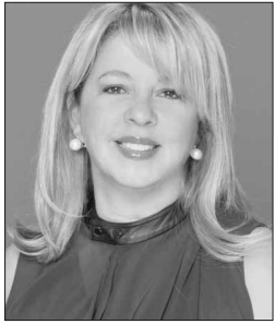
BY INGRID MACHADO, CEO of Miami Stem Cell®

Contrary to popular belief, at our Miami Stem Cell® Institute we have concrete evidence (based on the almost 7,500 procedures performed at our center and quantified in our extensive database), which includes almost 75% of patients over the age of 65, who were treated with their own Autologous Stem Cell Transplants and of